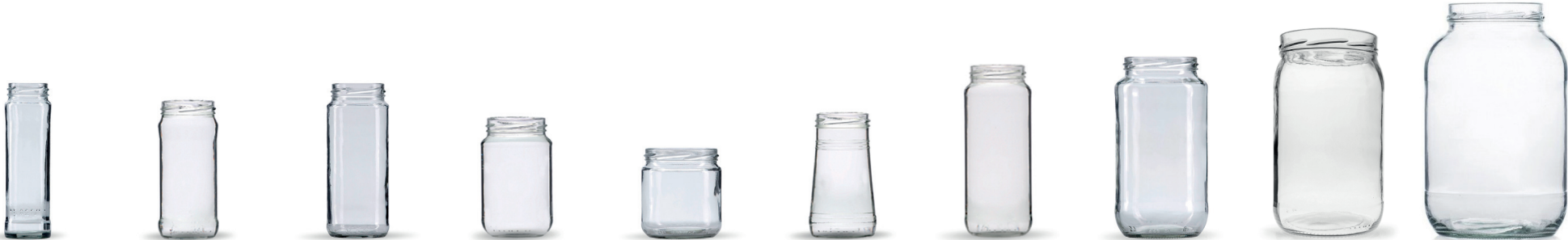
5 CYL - 2,8 Oz TALL JAR